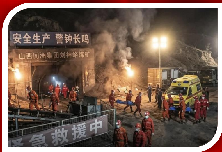
Coal Mine Explosion in China